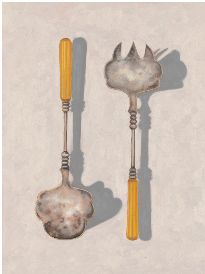
Salad Servers 2023 oil on birch board 30 x 23 cm $2,800