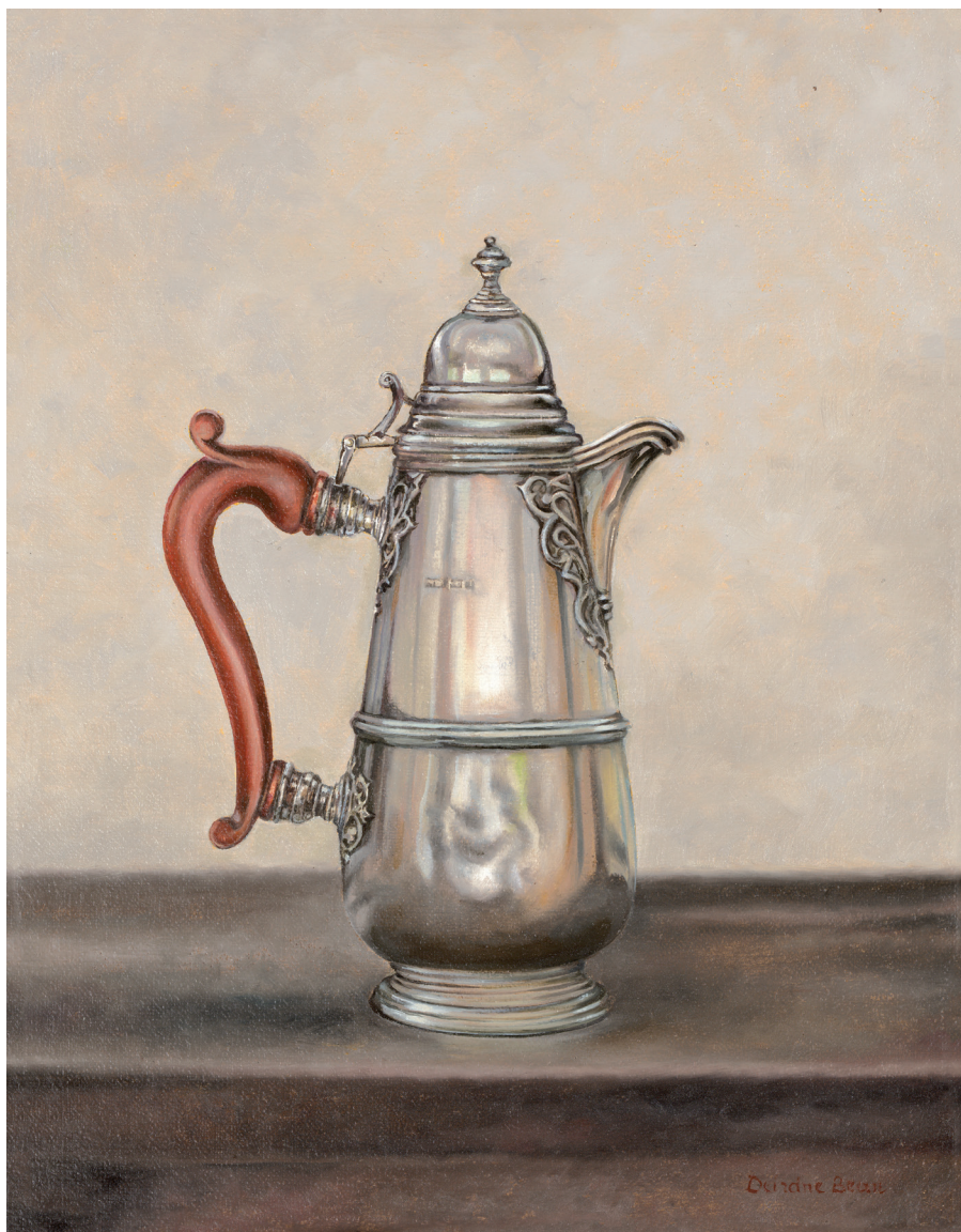
Patrick's Hot Milk Pot 1924 (after 1760 original) 2023 oil on linen 30 x 24 cm $2,800