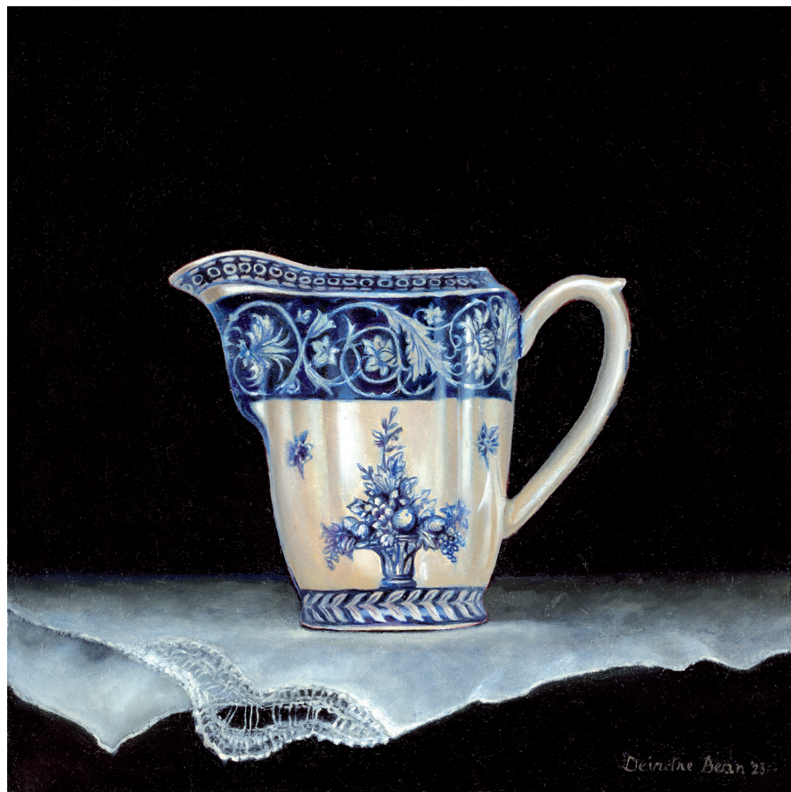
Blue and White Milk Jug and Serviette 2023 oil on birch board 20 x 20 cm $2,500