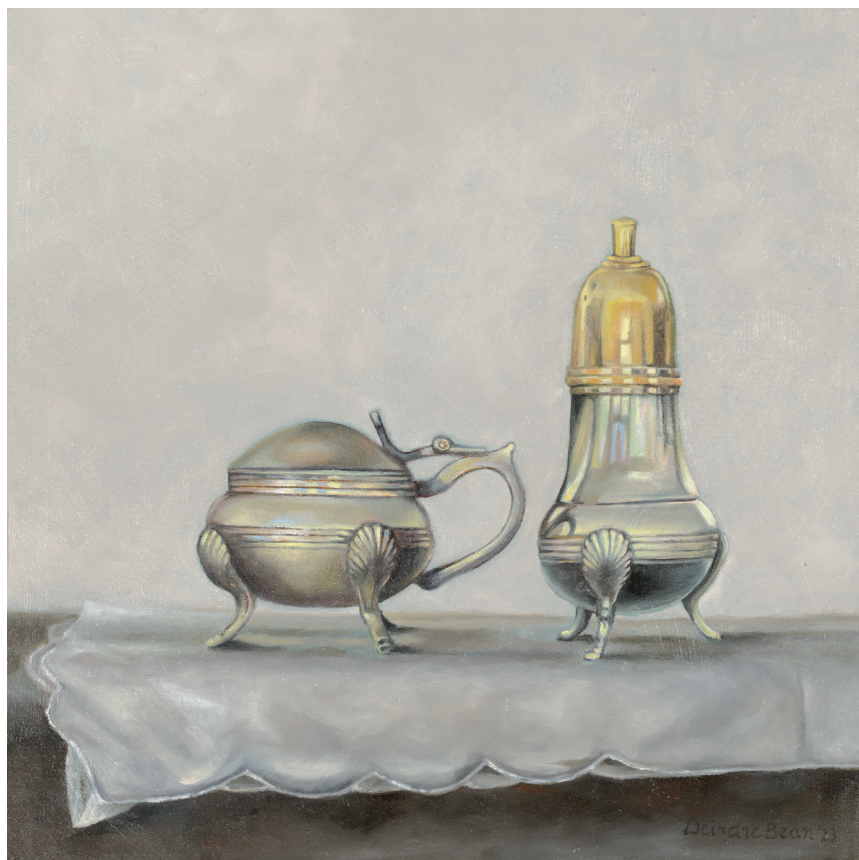
Silver Salt Cellar and Salt Shaker 2023 oil on birch board 20 x 20 cm $2,500