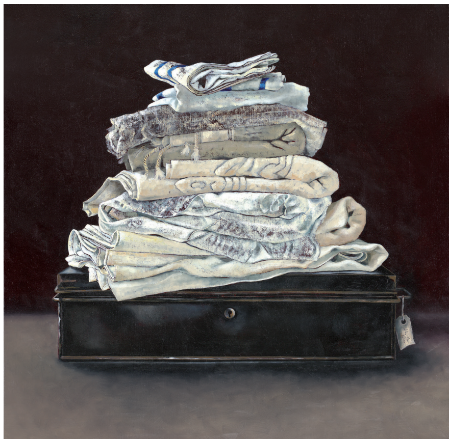
Trousseau (linen) 2021