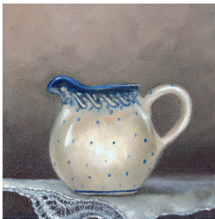
Small Milk Jug with Serviette 2023 oil on canvas 10 x 10 cm $550