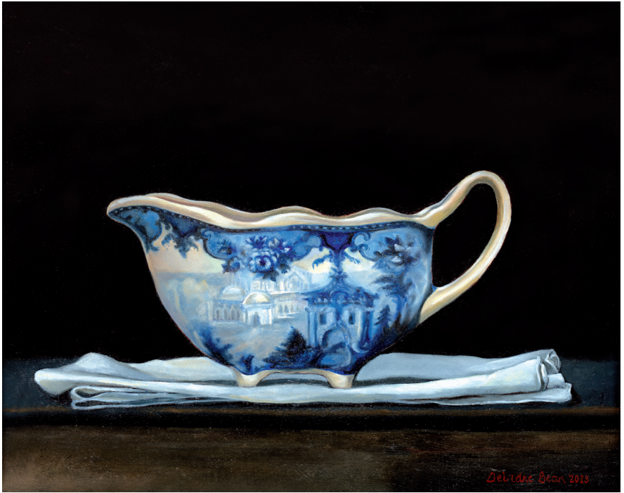
Blue and White Gravy Jug and Serviette 2023 oil on birch board 20 x 25 cm $2,600