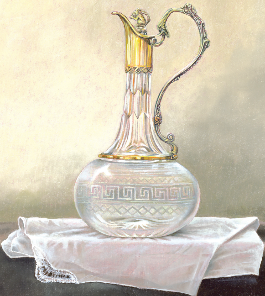
Rita's Decanter 2023 oil on linen 46 x 36 cm (detail) $4,300