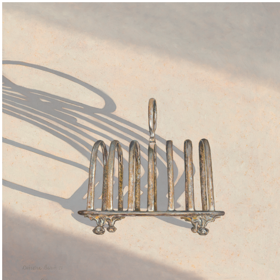
Toast Rack I 2022 oil on birch board 30 x 30 cm $3,200