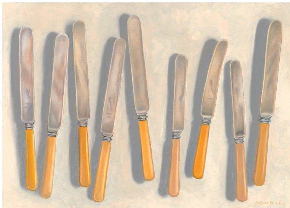
Nine Knives 2023 oil on birch board 30 x 42 cm $3,800