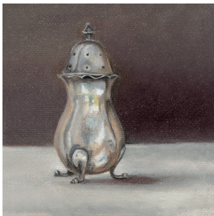
Small Silver Salt Shaker 2023 oil on canvas 10 x 10 cm $550