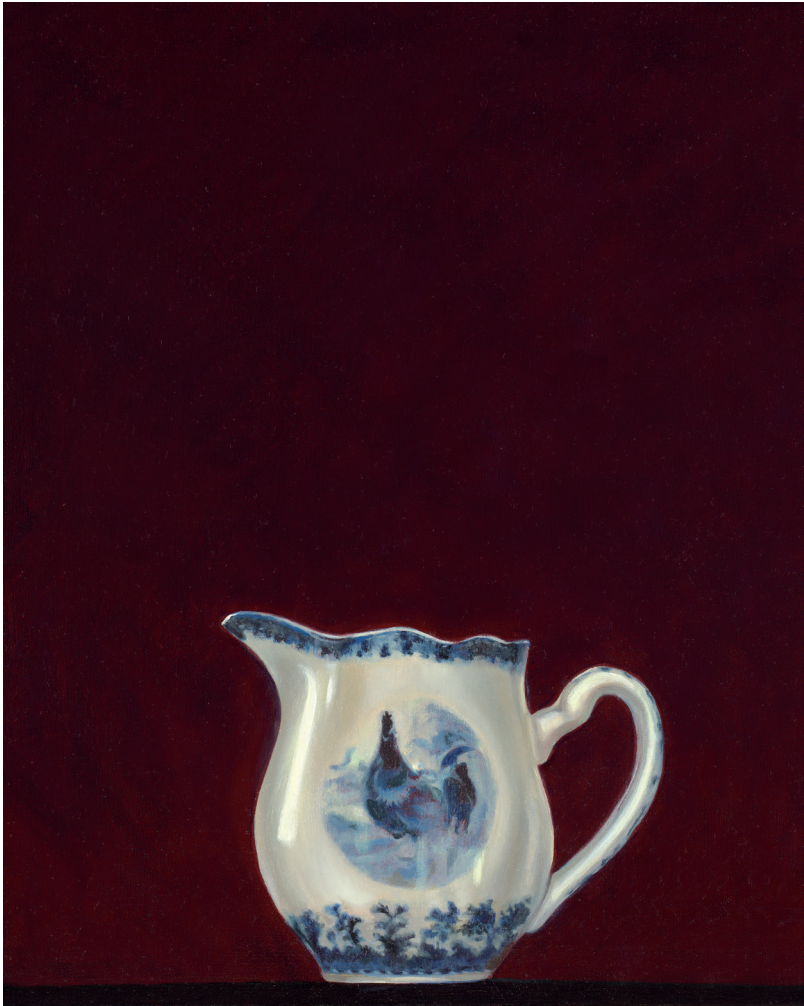
Blue and White Milk Jug with Rooster 2022