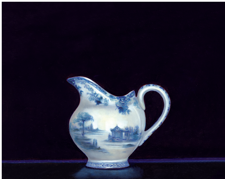
Mum's Blue and White Milk Jug 2022 oil on birch board 20 x 25 cm $2,600