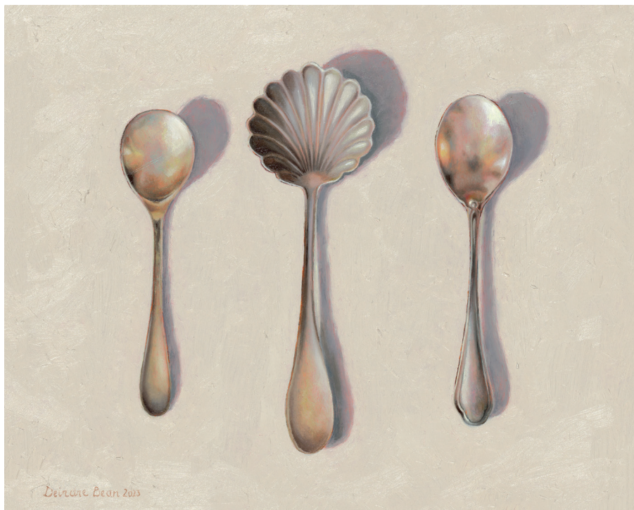
Three Spoons 2023 oil on birch board 20 x 25 cm $2,600