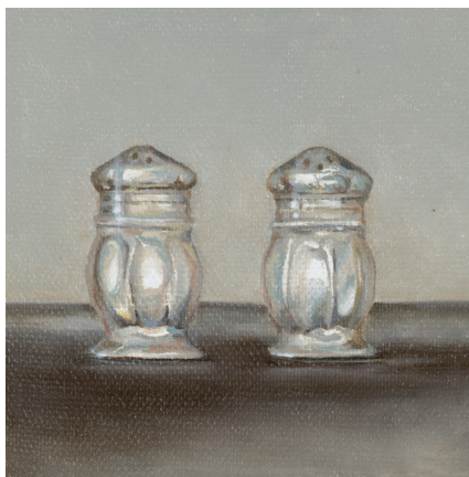
Small Silver Salt and Pepper Shakers 2023 oil on canvas 10 x 10 cm $550