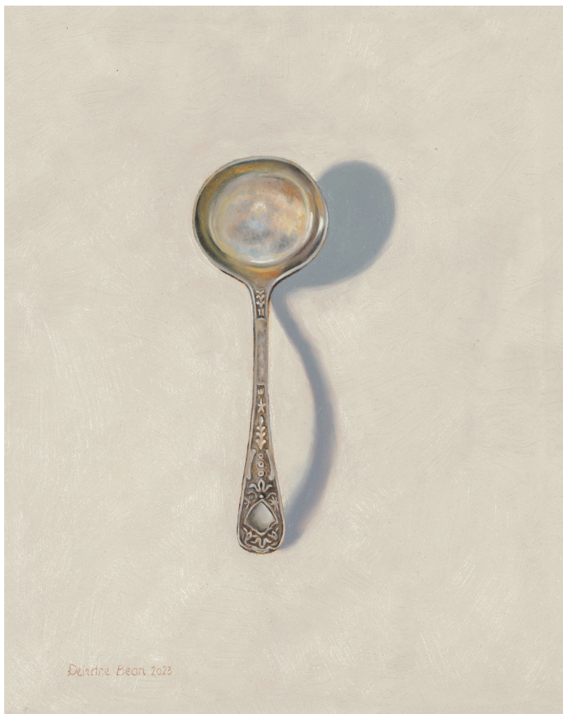
Cream Spoon II 2023 oil on birch board 25 x 20 cm $2,600