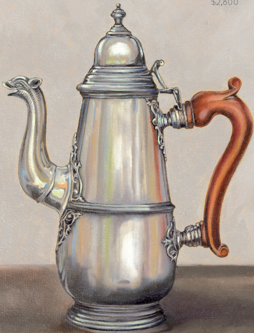
Patrick's Hot Chocolate Pot 1924 (after 1760 original) 2023 oil on linen 30 x 24 cm $2,800