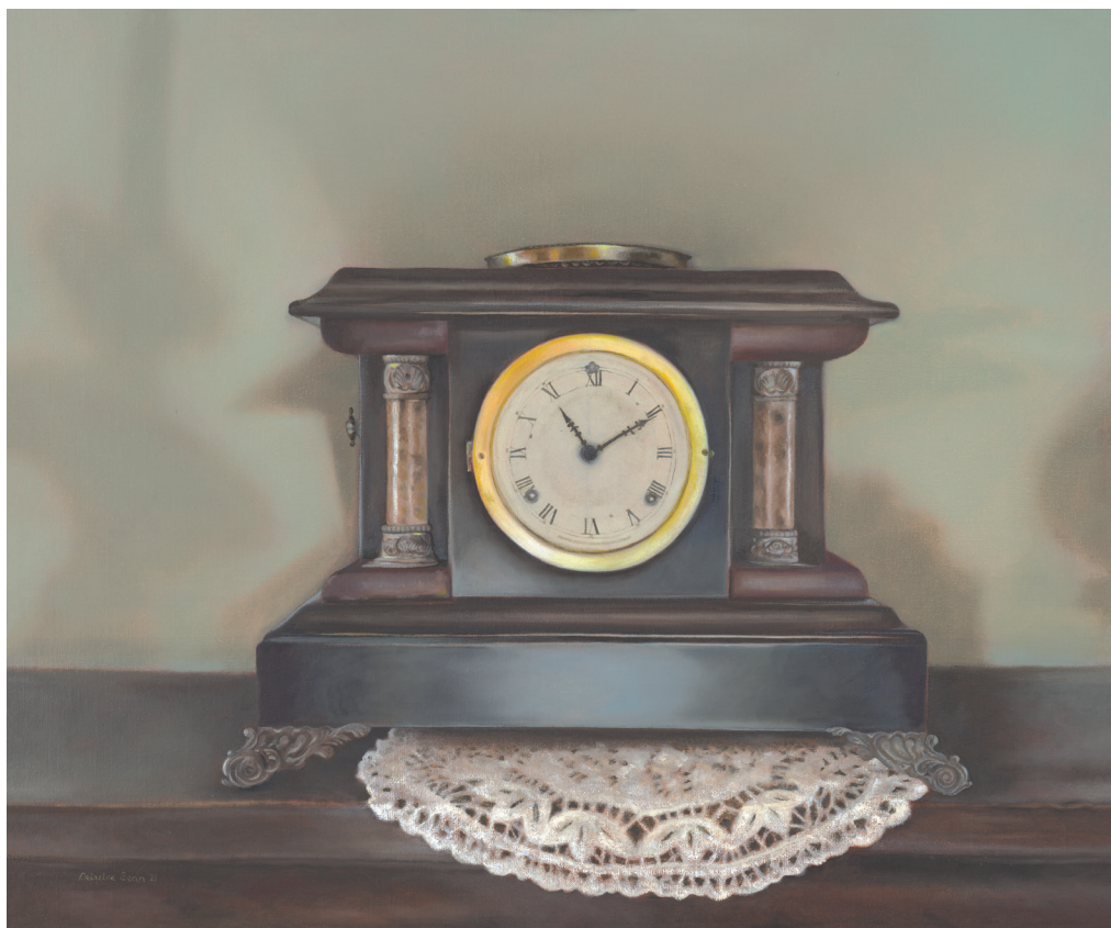
Hill End Mantle Clock 2021 oil on linen 50 x 60 cm $4,800