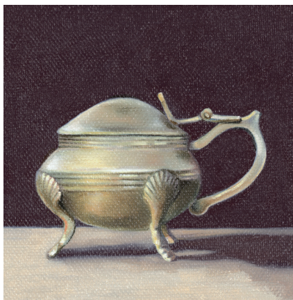
Small Silver Salt Cellar 2023 oil on canvas 10 x 10 cm $550