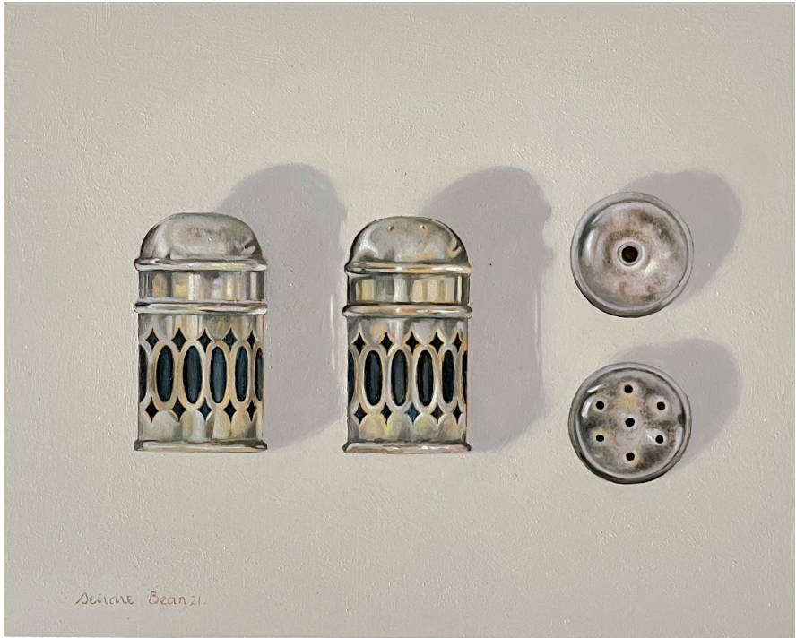
Silver Salt and Pepper Shakers 2021 oil on birch board 20 x 25 cm $2,600