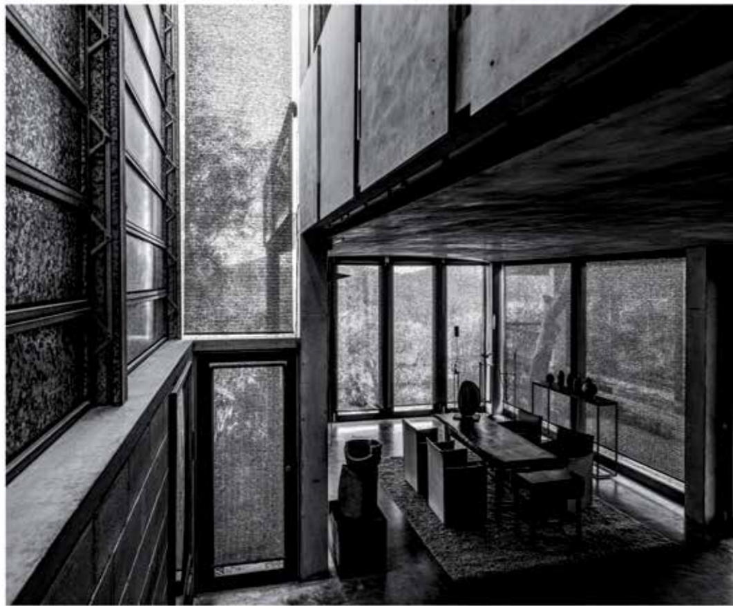
Riste Andrievski A constructed perspective 2021 photograph, archival inkjet 42x50cm, Edition of 5