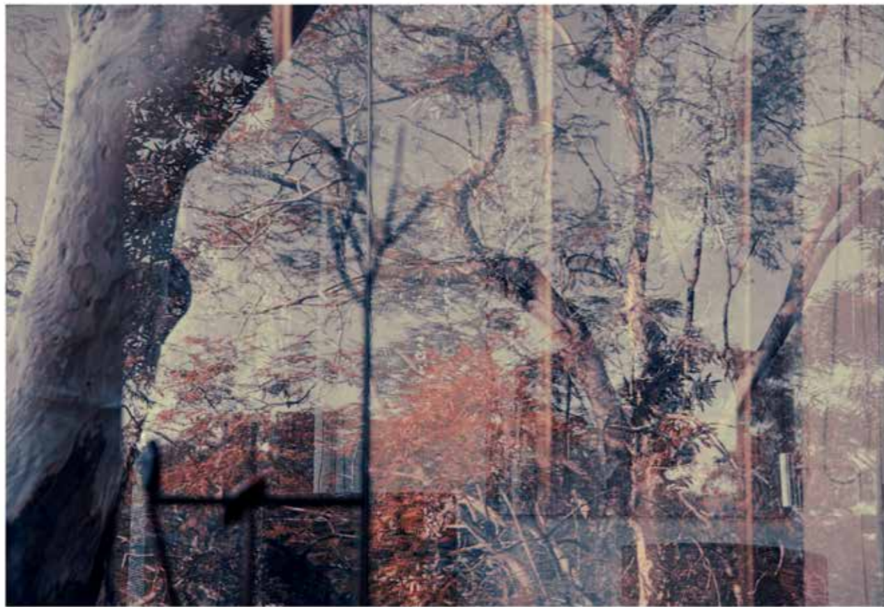
Riste Andrievski Fusion inside-out 2021 photograph, archival inkjet 44x64cm, Edition of 5