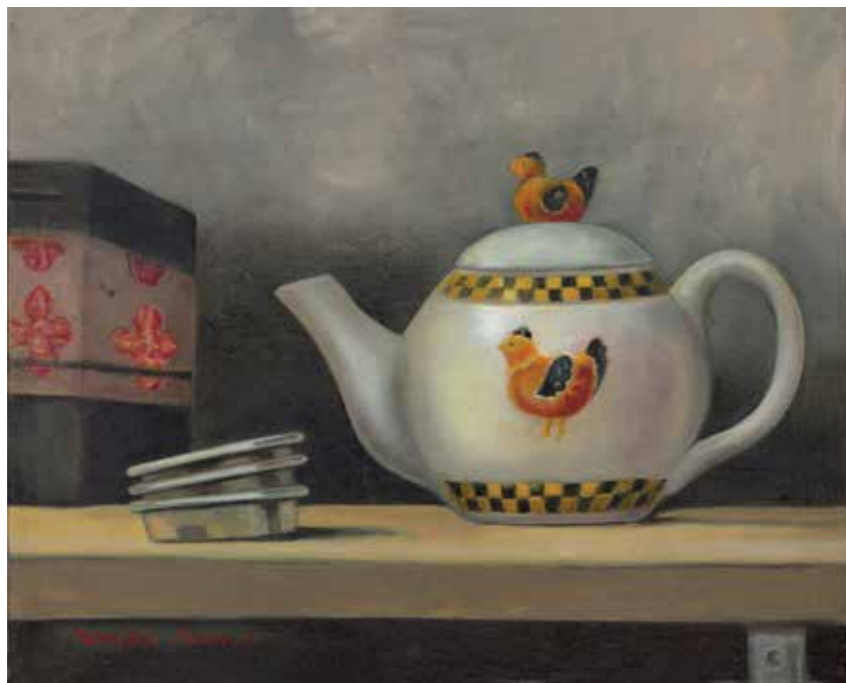
Deirdre Bean Teapot 2021 oil on canvas 20x25cm