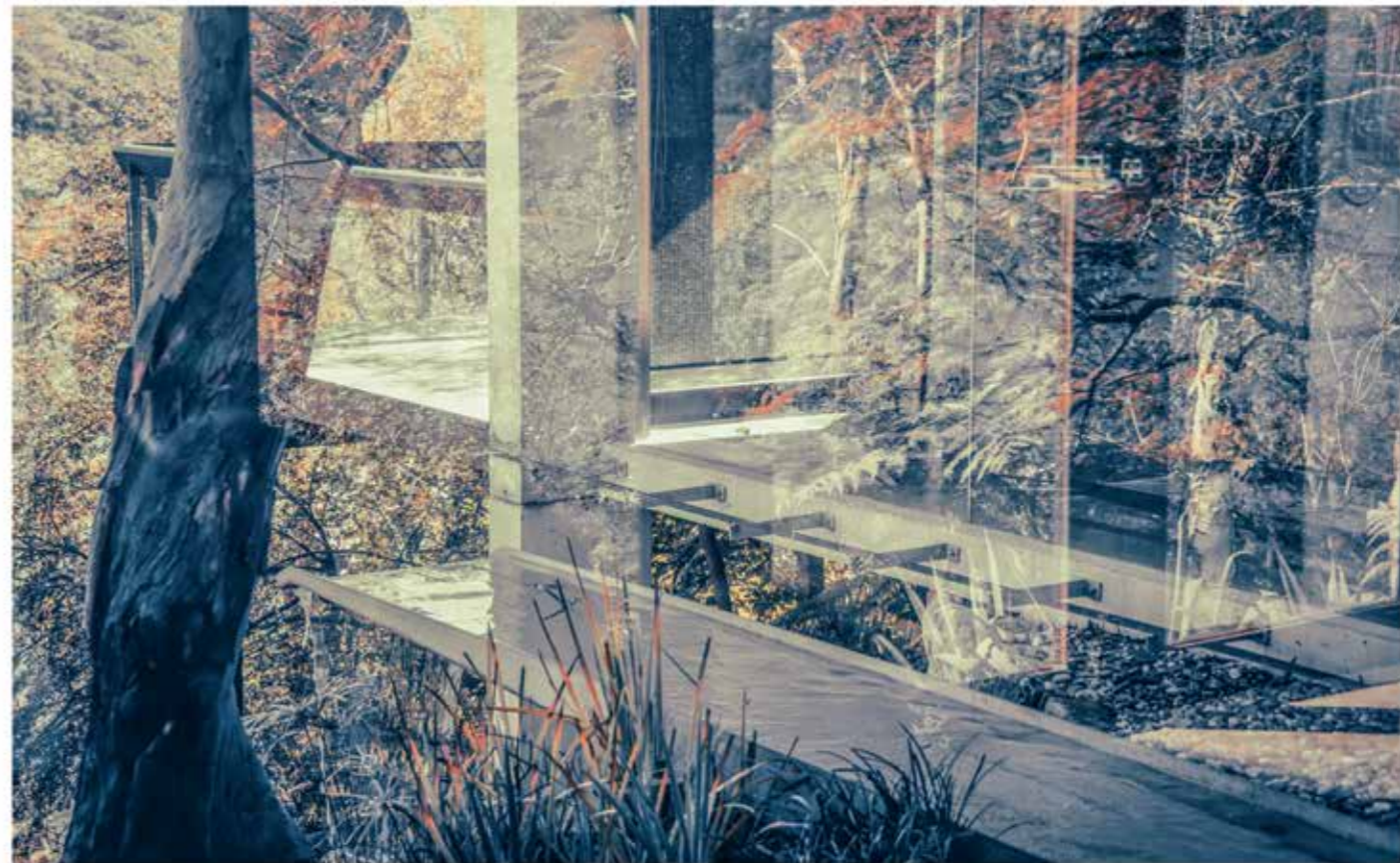
Riste Andrievski Ukiyo-e 2021 photograph, archival inkjet 43x69cm, Edition of 5