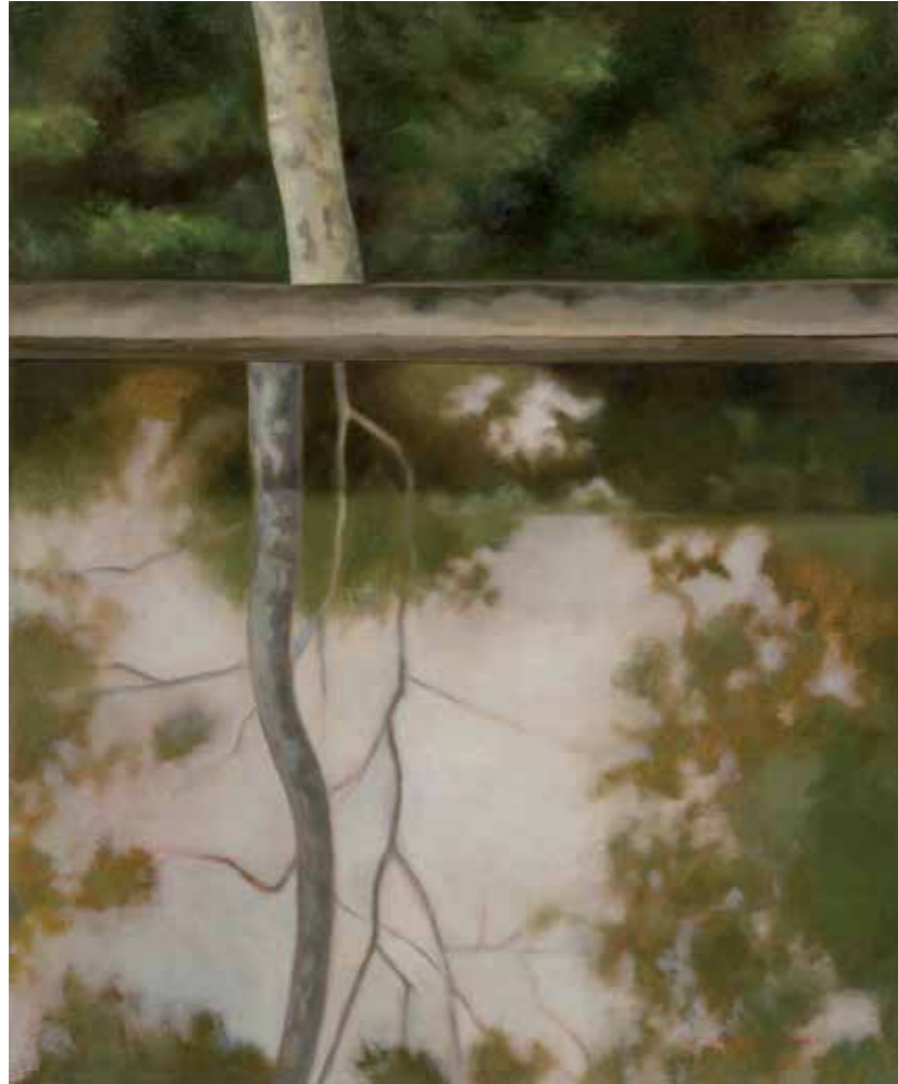
Deirdre Bean Tim's pool II 2021 oil on canvas 46x38cm