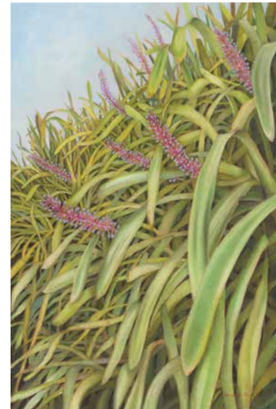
Deirdre Bean Bromeliad wall 2021 oil on canvas 60x40cm

2006 Gold Medal, Royal Horticultural Society, London