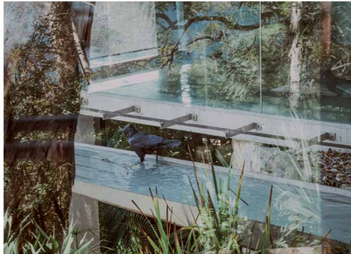
Riste Andrievski Springwater 2021 photograph, archival inkjet 50x60.5cm, Edition of 5