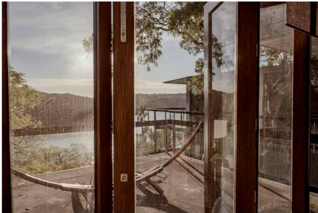
Riste Andrievski Seaforth 2021 photograph, archival inkjet 37x56cm, Edition of 5