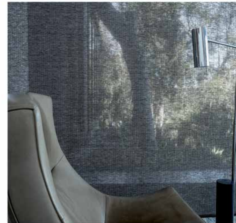
Riste Andrievski A view taken within 2021 photograph, archival inkjet 39x41cm, Edition of 5