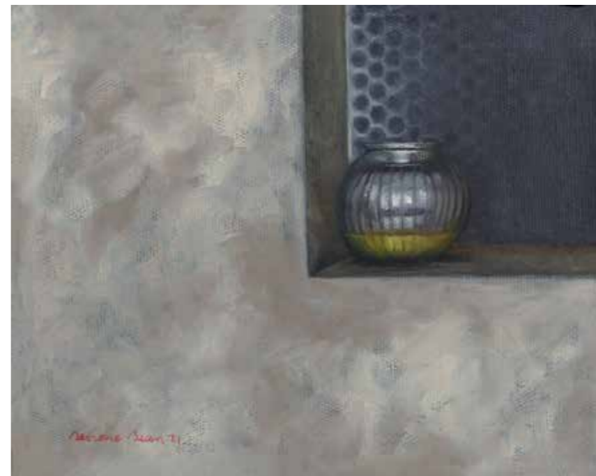
Deirdre Bean Tealight 2021 oil on canvas 20x25cm